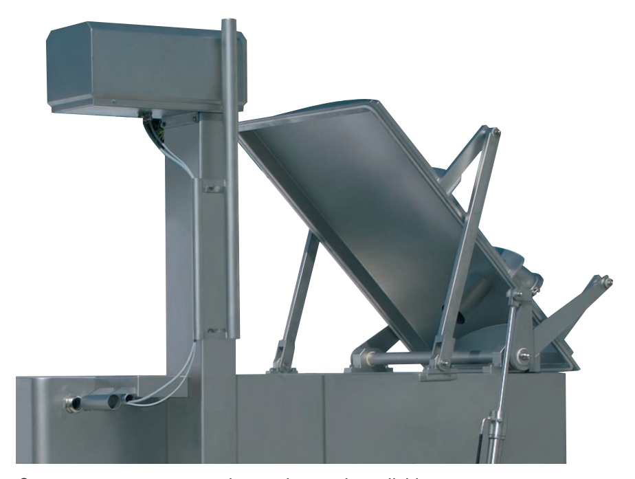
On request vacuum or gassing equipment is available.

The ULTRA MONO features a mixing unit that achieves exceptional productivity. For optimal processing results the mixing unit is available in the following versions: paddle, mushroom head, pointed rake and Z-arm shafts. The mixing intervals can thus be optimally configured and adapted to the individual production needs. The feed and cutting auger can be easily disassembled without having to remove the mixing unit.